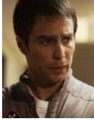
Duncan Jones' debut feature gets Michael Powell Award.